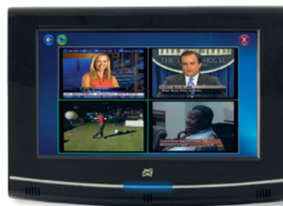
Life|vision 4-up view shown on a Life|point® touch panel